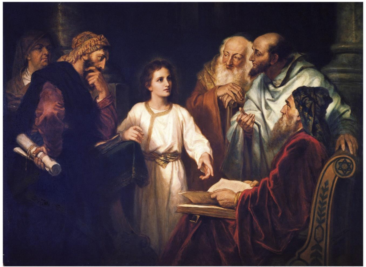
Christ in the Temple, by Heinrich Hofmann

The next record of Jesus occurs when he is 12 years old: